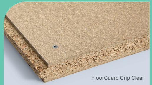
FloorGuard Grip Clear