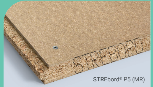
STREbord® P5 (MR)