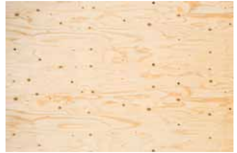
III = Open defects more generally allowed

Machinings: By request edge machinings tongue and groove and half lap.