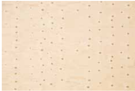
II = Some small open defects allowed

Surface: Face qualities according to EN 635 - 3:1995 WISA-Spruce is fully sanded 2 sides.